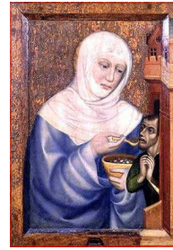
Elizabeth of Hungary