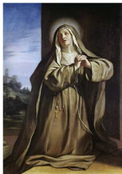
St Margaret of Cortona